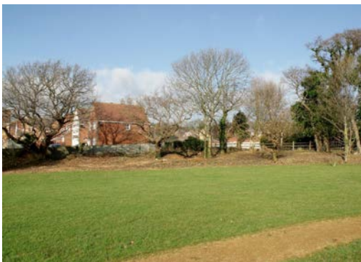
Adur Park off Tillingham Way