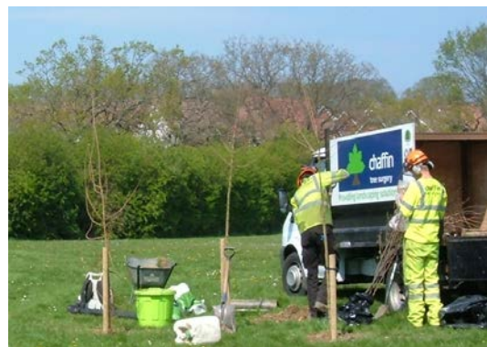
Contractors planting new trees in Adur Park