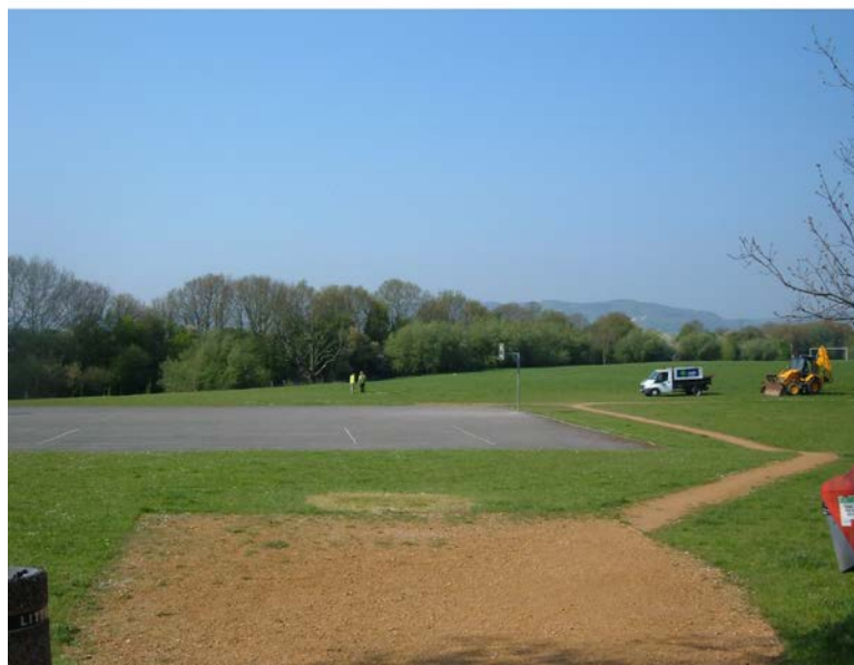
The Basketball Court